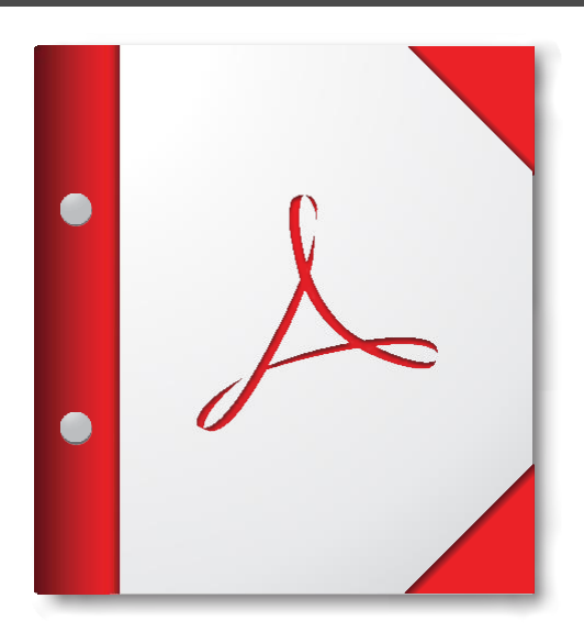
For the best experience, open this PDF portfolio in Acrobat X or Adobe Reader X, or later.